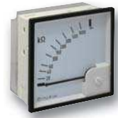
Indicating instrument RP 5898