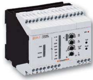
Insulation monitor LK 5896/900